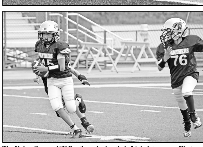
The Union County 10U Panthers during their 24-6 victory over West Hall on Saturday.